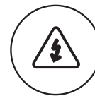
Low Voltage Cabling