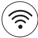
Wired & Wireless Networks